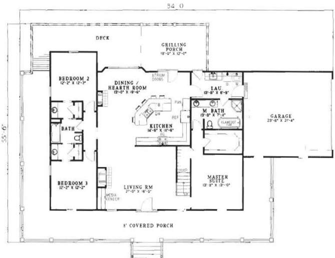
First Floor 1,921 sq. ft.